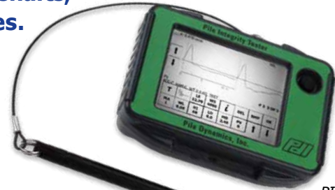
PIT-X; PIT-XFV has a similar look

The PIT test consists of placing one or two accelerometers on the foundation to be tested, (generally at least one on the exposed top), and hitting it with a small hand held hammer (instrumented or not). The impact of the hammer generates a stress wave that propagates down the foundation and reflects back up. The accelerometer collects data that reveals the pattern of wave propagation and reflection. Piles with flawless shafts typically show a reflection from the pile toe at the expected time, which corresponds to the pile length. If a defect is present along the shaft, its size and location affect the propagation and reflection of the wave. PIT tests may also help estimate the depth of the pile toe (the pile length) in intact piles with embedments less than 30 diameters. PIT data is evaluated in the field and later transferred to a personal computer for further analysis by the PIT-W software.