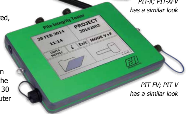
PIT-FV; PIT-V has a similar look